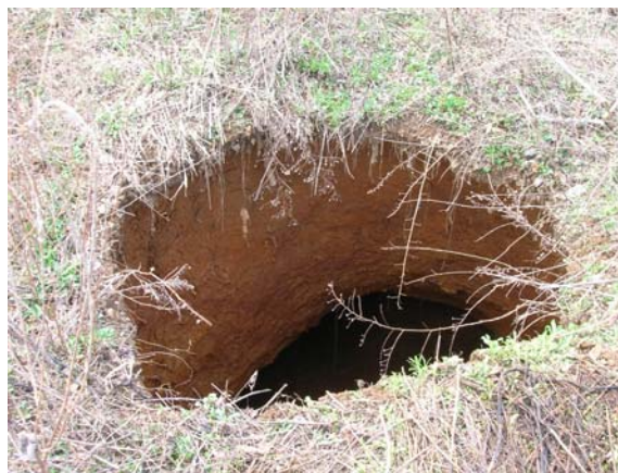
Figure 4B. Actively forming cover collapse sinkhole in cohesive, fine-grained sediments.