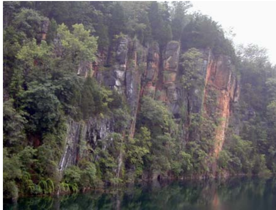
Figure 9. The epikarst exposed in an abandoned limestone quarry wall, showing steeply-angled open solution-modified fractures extending down to the quarry lake. The lake is representative of the local phreatic base-level, and demonstrates how contaminants and surface water can readily migrate to the underlying water table.

condition informally referred to as “sinkhole weather” which is characterized by extended dry weather or drought punctuated by periods of heavy rain. Sinkholes will often form when these conditions are present.