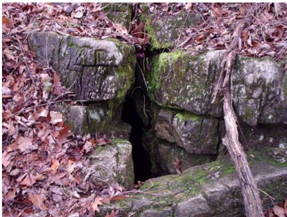
Figure 4D. Mature, rock-walled sinkhole with open "throat" (i.e. cave entrance).