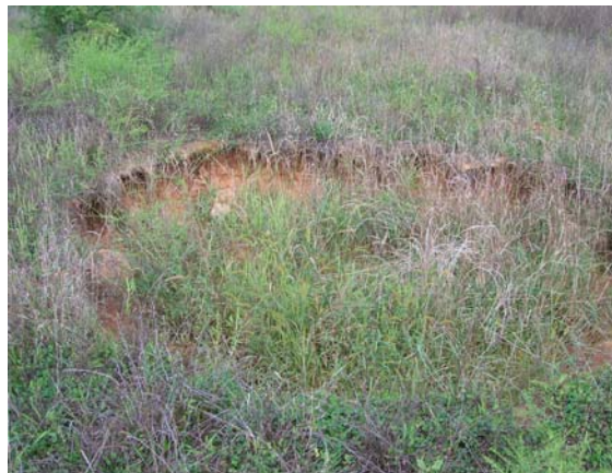
Figure 4A. Actively forming cover collapse sinkhole in granular sediments.

The investigator should be aware of any area where there are signs that water is actively infiltrating into the surface, as this may be an indicator of a subsurface conduit that is soil-filled but receiving drainage (see Figure 6). In this regard, distinct changes in vegetation can be a clue if topographic is slight or absent. These areas should be carefully noted and investigated if they are to be impacted by proposed site development, as they can be the site of sudden and catastrophic subsidence if not managed properly.