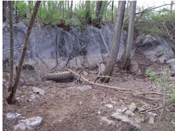
Figure 5A. An estavelle in groundwater low-stand conditions. Note the tell-tale water mark along the rock wall of the structure.

below the opening. This type of structure is sometimes called a "natural trap".