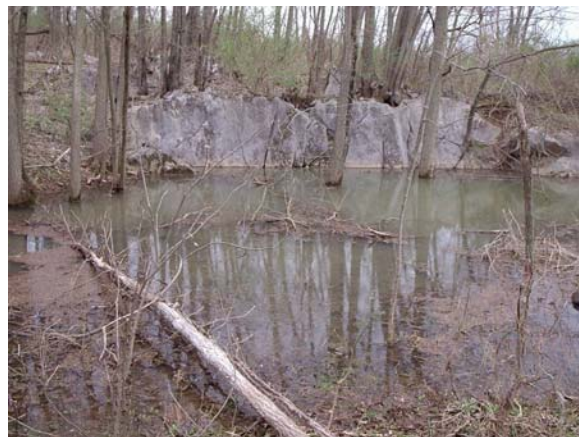
Figure 5B. The same structure as shown in Figure 5A during groundwater high stand conditions. When this photograph was taken the estavelle was an active, ephemeral spring with an outflow measured at 60 gpm.