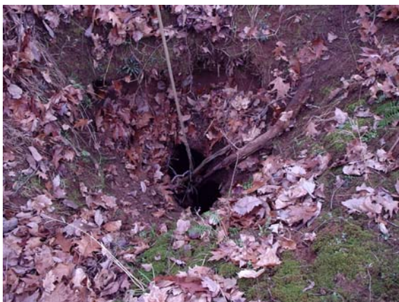
Figure 4E. Soil-bottomed sinkhole with open "throat". A 40' deep vertical cave lies

below the opening. This type of structure is sometimes called a "natural trap".