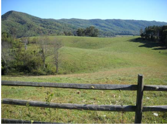
Figure 4C. Mature, stable sinkholes in cohesive soils.