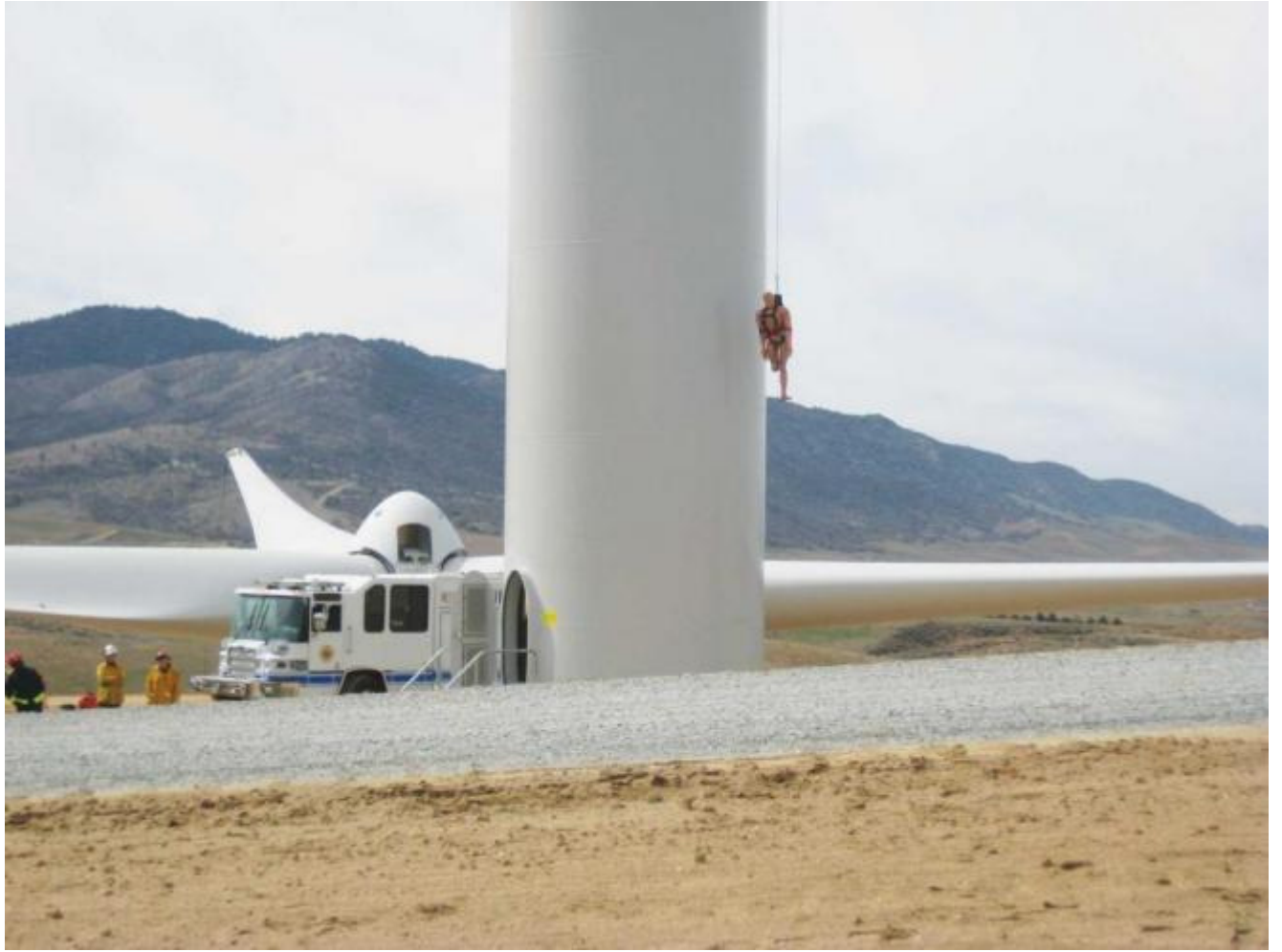
Departments with wind turbines in their response areas should consider acquiring their own high-angle rescue equipment.