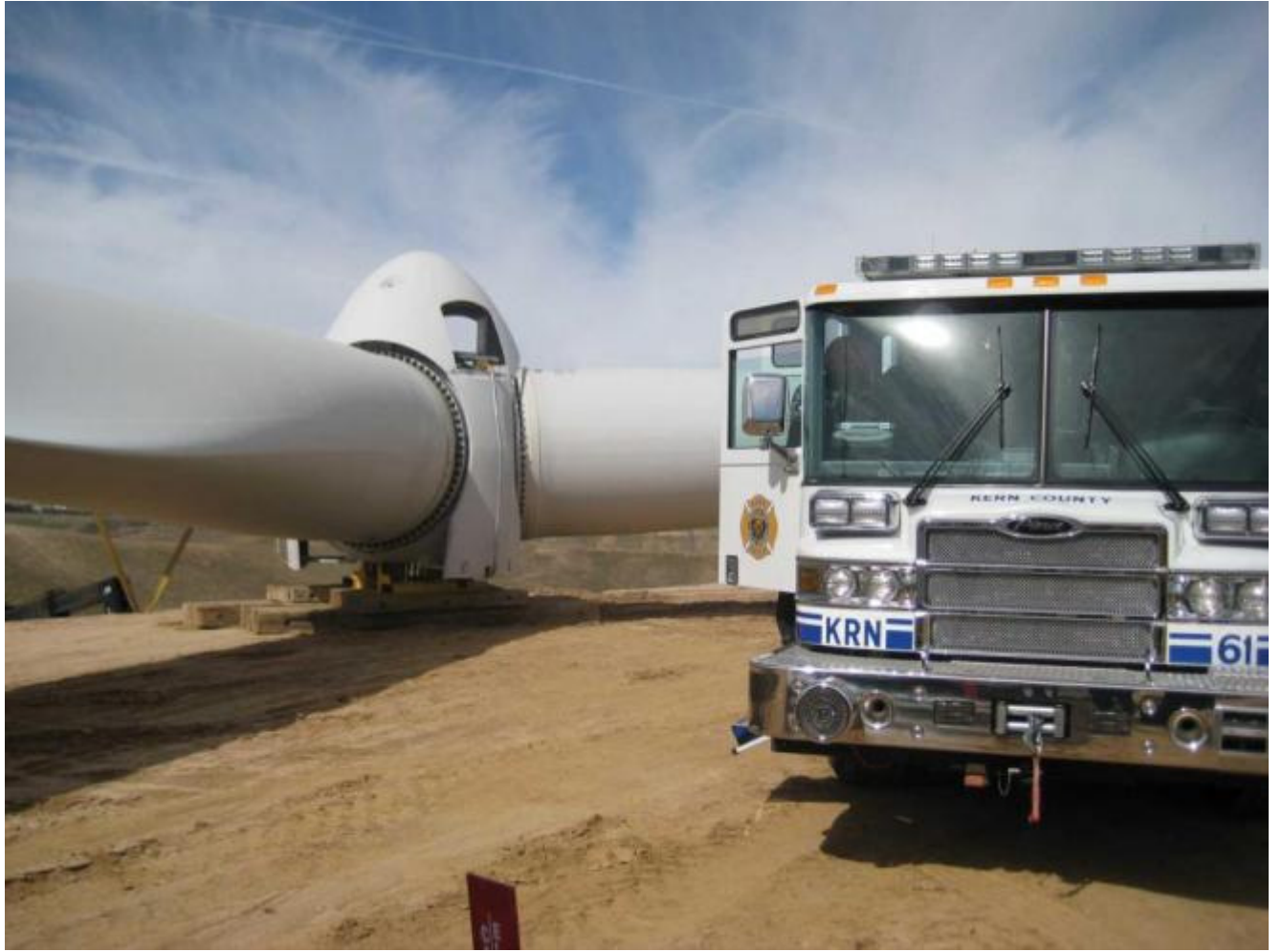
In March 2014, multiple engine companies, along with both USAR companies, Truck 65, and Helicopter 407 of the KCFD, converged on a wind turbine in the Tehachapi foothills.