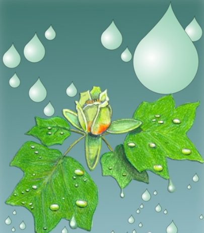
Tree leaves protect the soil

Our great rivers begin their lives in our mountain forests. Rainfall is greatest on our Allegheny Mountain ridges. Water is a powerful force. Heavy rain can wash away the soil on the forest floor, but trees and other plants use their leaves and branches to break big raindrops into little ones which fall gently to the ground where they can be absorbed.